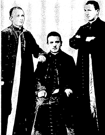
YOUTHFUL POPE JOHN -The late Pope John is shown above (center) as a young seminarian. In college, the case of the smuggled apples put him in "hot water."