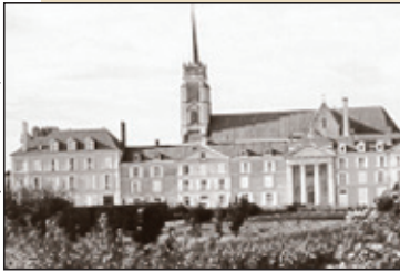
The Motherhouse of the Sisters of Providence at Ruillé-sur-Loir.

Anne-Thérèse entered the Congregation of the Sisters of Providence of Ruillé-sur-Loir, France, on Aug. 18, 1823. She was given the name Sister St. Theodore. The name "Theodore" means "gift of God."