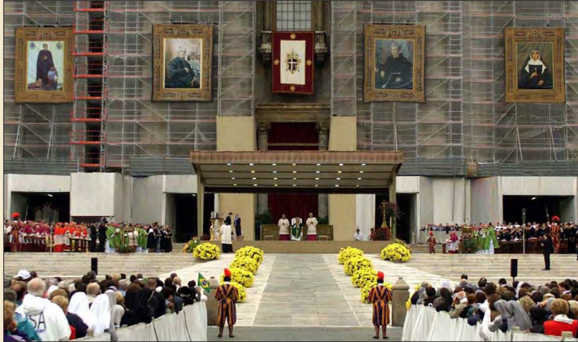
People attend the 1998 Mass at St. Peter's Square in Rome at which Blessed Mother Theodore Guérin was beatified. The facade of St. Peter's Basilica was covered at the time for restoration. Pilgrims participating in the upcoming archdiocesan pilgrimage will attend a similar liturgy on Oct. 15 at which the 19th century foundress of the Sisters of Providence of Saint Mary-of-the-Woods will be canonized.

In addition to witnessing the declaration of Blessed Mother Theodore's sainthood, the pilgrims will also visit