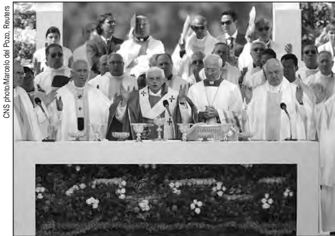
Pope Benedict XVI celebrates Mass at the Fifth World Meeting of Families in Valencia, Spain, on July 9.