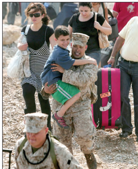
A U.S. Marine from the USS Nashville carries a child onto a landing craft on a beach in Lebanon on July 20. About 40 Marines arrived in a Christian area north of Beirut at dawn to ferry about 1,200 Americans to Cyprus in efforts to extract U.S. citizens caught in the war zone.