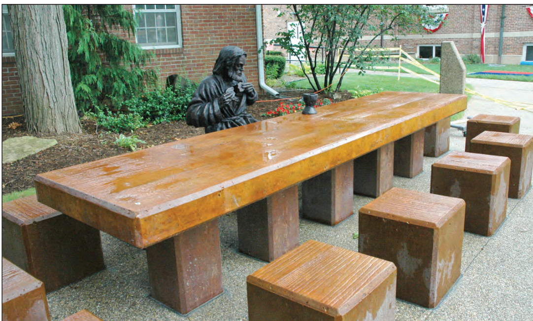
A large table and 12 seats in "The Last Supper" sculpture invite people to sit at Christ's table and challenge them to become his disciples today. The sculpture is located in front of the St. Christopher Parish Activity Center and parish office at 5301 W. 16th St. in Indianapolis.