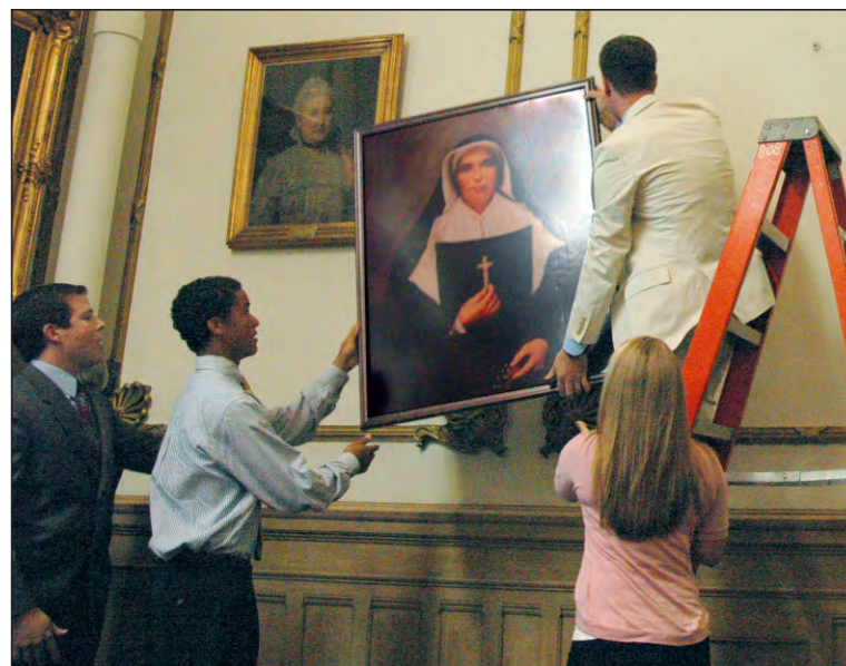
Staff members prepare to hang a portrait of Blessed Mother Theodore Guérin, who will be canonized by Pope Benedict XVI during an Oct. 15 liturgy at St. Peter’s Square in Rome.