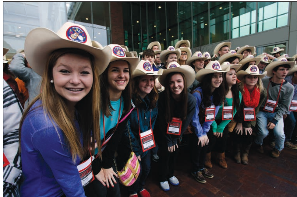
Teenagers from the Diocese of Nashville, Tenn., sport cowboy hats during the National Catholic Youth Conference on Nov. 21 in the Indiana Convention Center in Indianapolis.