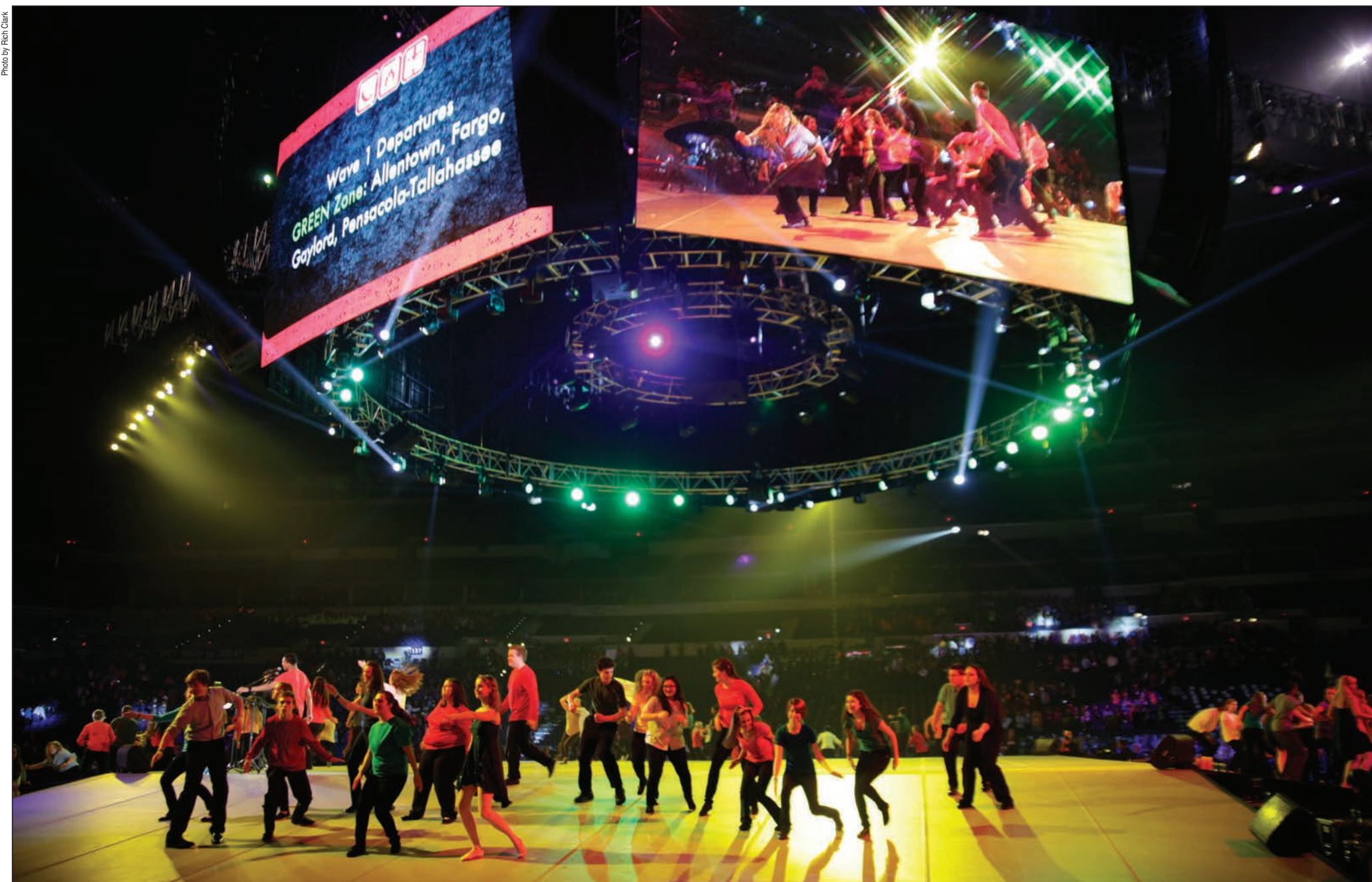
Above, animators lead the crowd in song during the Nov. 21 opening session of the National Catholic Youth Conference in Lucas Oil Stadium in Indianapolis. The conference, which drew 23,000 youths from across the country, took place on Nov. 21-23 in the stadium and the adjacent Indiana Convention Center.