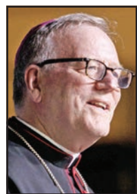
Bishop Robert E. Barron

The Church celebrates the month of June in dedication to the Most Sacred Heart of Jesus, who pours out his